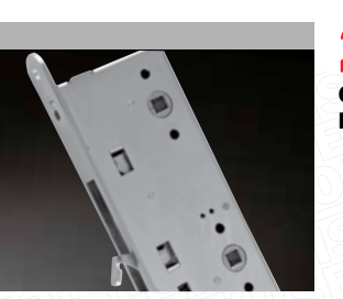
212 COUNTERLOCK FOR FIRE DOORS / PANIC EXIT DOORS